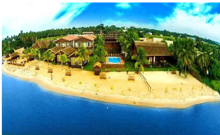
Aqua Safari Resort in Lake Volta

Ghanaian cuisine combines local and international culinary influences, resulting in a distinctive fusion of tastes and textures. Along with its delectable cuisine, Ghana is known for its warm hospitality; as a result, travelers are frequently welcomed with open arms and invited to share a meal with residents.