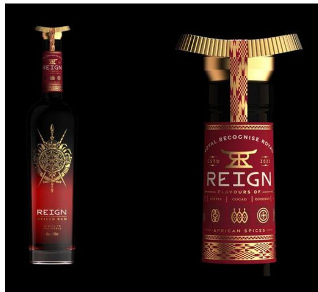
Reign Rum - Luxury Rum Made in Ghana