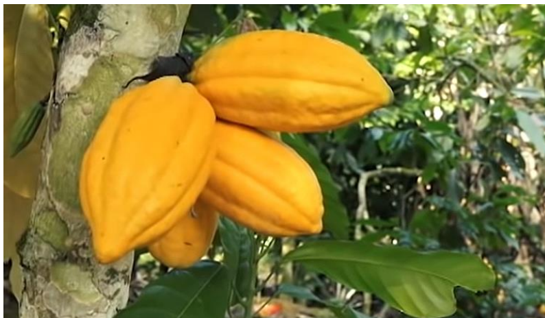
Cocoa Production in Ghana