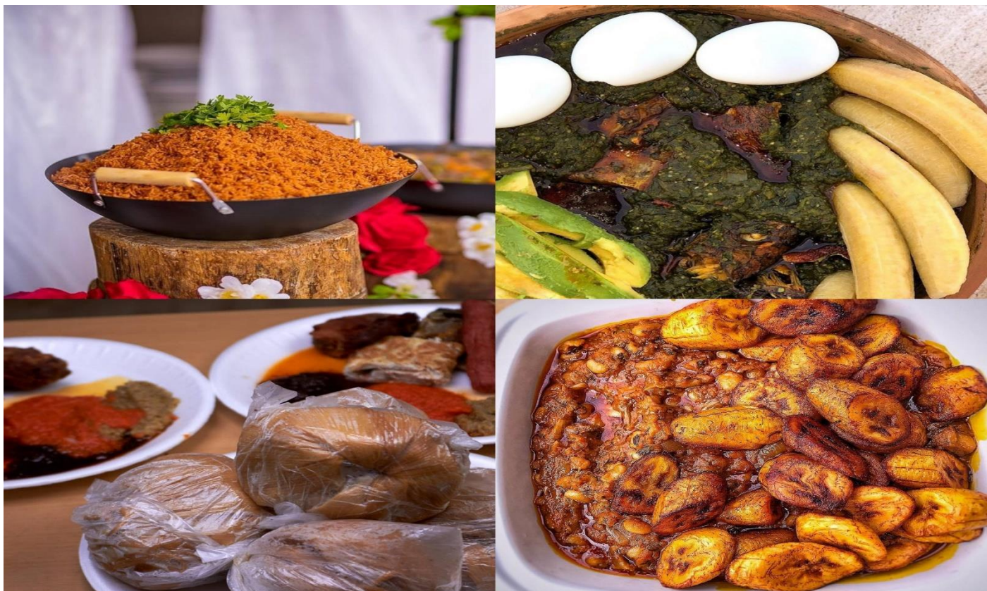
Local Ghanaian Dishes